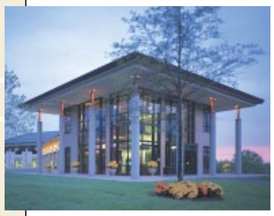
The National Conference Center — a bucolic setting for AWT's Spring Leadership Conference.

T he 19th Annual AWI Spring Leadership Conference, April 5-8, 2006, will lead AWI members down a new path to learning. There are two groups of sessions: one offering personal growth experiences; the other providing business growth opportunities. The winning combination is sure to reward attendees with new tips and tactics for enhancing leadership skills and improving business profitability.