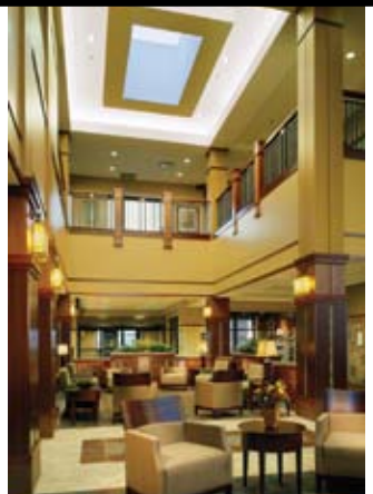
Hospitality Category: Montbleau and Associates, Inc. of San Diego, CA for The Grand Del Mar Resort in San Diego.