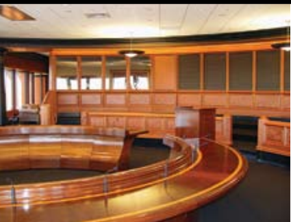
Overall and Corporate Office Category: Fabrication Specialists, Inc. of Mobile, AL for the Board Room of the Retirement Systems of Alabama in Montgomery.

The standout among these outstanding projects was the Board Room of the Retirement Systems of Alabama, a project exemplifying the finest architectural woodwork by Fabrication Specialists, Inc. of Mobile, AL. In addition to recognition as “Overall” winner, Fabrication Specialists was also honored with a “Standard of Excellence” Award for the same project in the “Corporate Office” category.