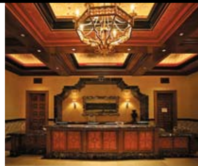
Health Care Category: Calmar Manufacturing Company, Inc. of Calmar, IA for the Midwest Medical Center in Galena, IL.