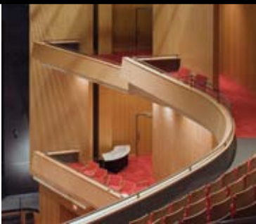
Public Facility Category: Triangle Case Work Inc. of Raleigh, NC for the Durham Performing Arts Center in NC.