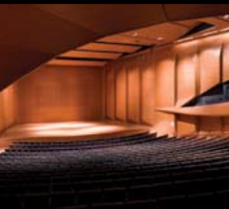
Category: Architectural Woodwork of West Valley Alice Tully Hall in New York City.

Design Solutions is circulated to designers and architects quarterly to illustrate the quality of the work performed by members of AWI. The magazine also includes a listing of all AWI Manufacturing Members in the back of each issue, and identifies those that are participants in the AWI Quality Certification Program. •